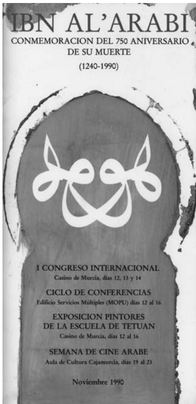
The poster which appeared on walls all round Murcia in 1990

More details will be posted on the Society's web site as they become available.