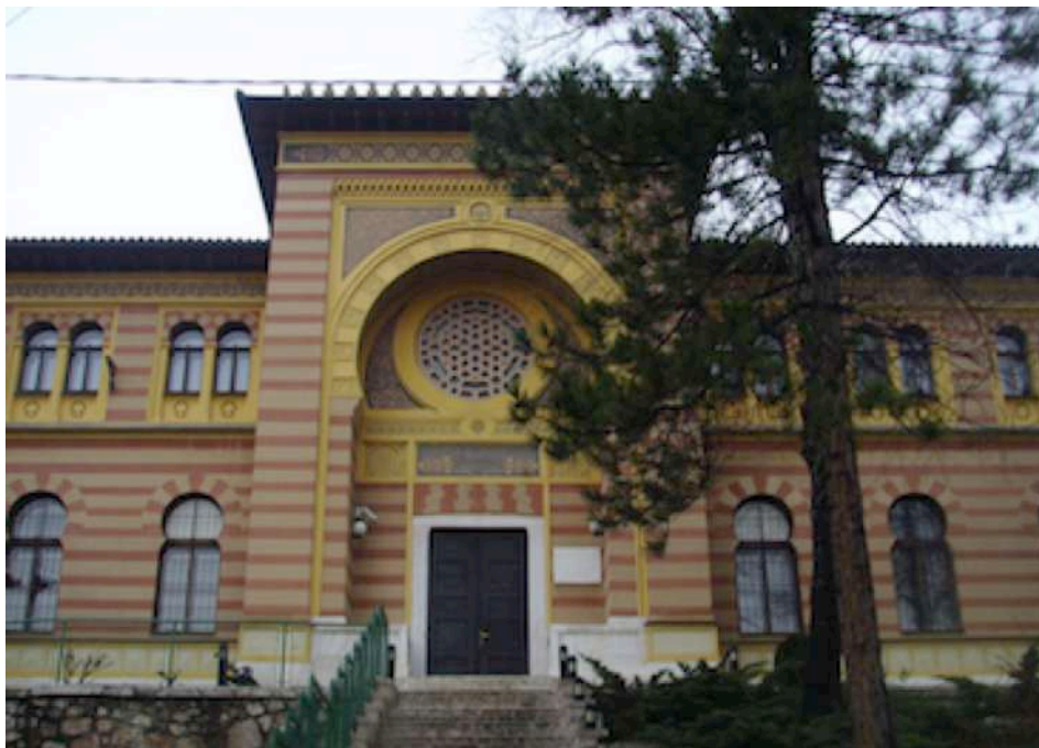
University of Sarajevo - Faculty of Islamic Studies

The working language of the Summer School will be English.