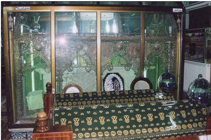
Ibn 'Arabī's tomb in Damascus

Many of the concepts exposed by Ibn 'Arabī in a profound, daring and often enigmatic language have become the actual foundations of later Sufism. The two main themes of his thought revolve around the notions of 'Unicity of Being' ( waḥdat al-wujūd , a term first used by his disciple Qunawī) and of the 'Perfect Man' ( al-insān al-kāmil ). It is not difficult to see in them the metaphysical dimension of the double formula of the Islamic profession of Faith. Both have been extensively elaborated by the interpreters of his thought, personalities like Ṣadr al-Dīn Qūnawī (d. 1274), Mu'ayyad al-Dīn Jandī (d. 1300), Sa'd al-Dīn Farghānī (d. 1300), 'Abd al-Razzāq Qāshānī (d. 1330), Dawūd Qayṣarī (d. 1350), Haydar Amoli (d. 1384), 'Abd al-Karīm al-Jīlī (d. 1403), Molla Ṣadra Shirāzī (d. 1636), Abd Allah Busnawi (d. 1644), up to the most recent 'Abd al-Ghani Nabulusi (d. 1731) and Emir 'Abd al-Qādir (d. 1883), only to mention the most famous ones.